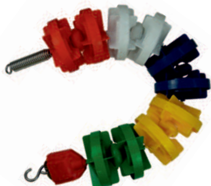
Competition Elite Floating Lane – Stainless Steel

E5304.MTSS – METER E5304.25SS – 25M E5304.50SS – 50M