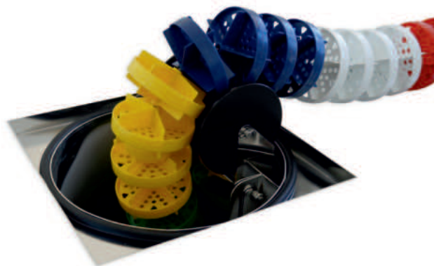
Under deck float lane storage system AISI 316