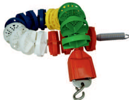
Competition Floating Lane – Stainless Steel

E5304.MTSS – METER E5304.25SS – 25M E5304.50SS – 50M