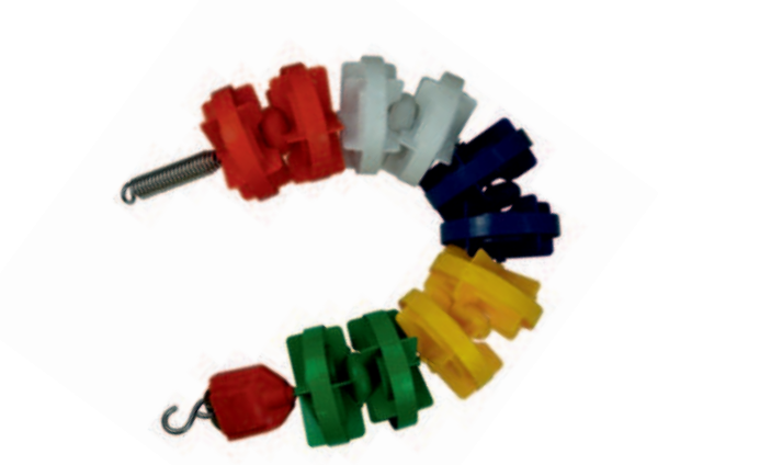
"Olympic" PRO Floating Lane - Stainless Steel

E5304.MTSS - METER E5304.25SS - 25M E5304.50SS - 50M