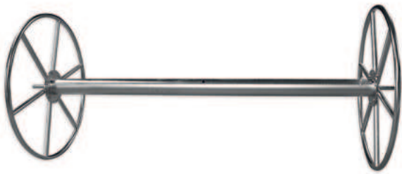
Floating Lane Roller

E5239.MTSS - METER E5239.25SS - 25M E5239.50SS - 50M