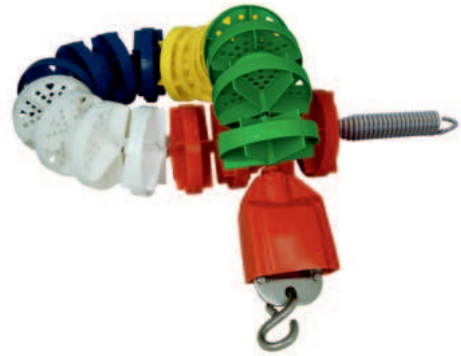
"Olympic" Floating Lane - Stainless Steel

E5304.MTSS - METER E5304.25SS - 25M E5304.50SS - 50M