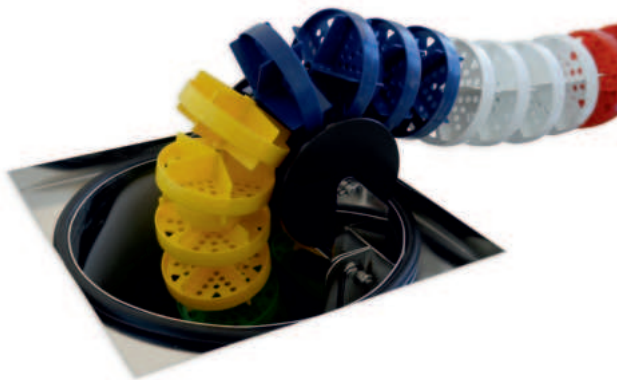
Under deck float lane storage system AISI 316